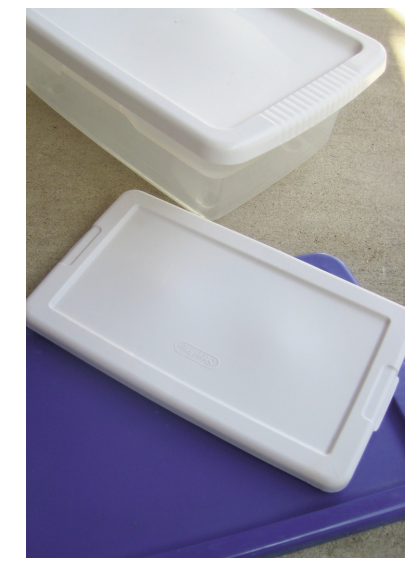
Examples of the type of Plastic Tray: not deep